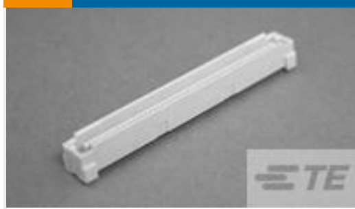
TE Part # 3-5179230-0 0.8FH,P06H.5,200,08/Sn,TU,SC