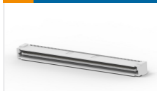
TE Part # CAT-313-PCB180 Plug Connector: Free Height, Board-Board, Vertical